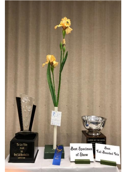
Best of Show No Egrets