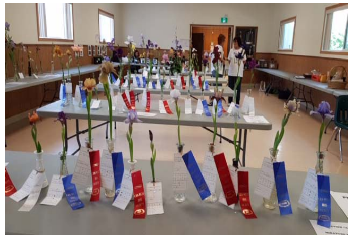
Top left: IB Cherie Amour, Best In Show, Section award. Top right: IB Star In The Night, People's Choice award Bottom left: BB Pass The Pepper, Section award Bottom right: Exhibition tables